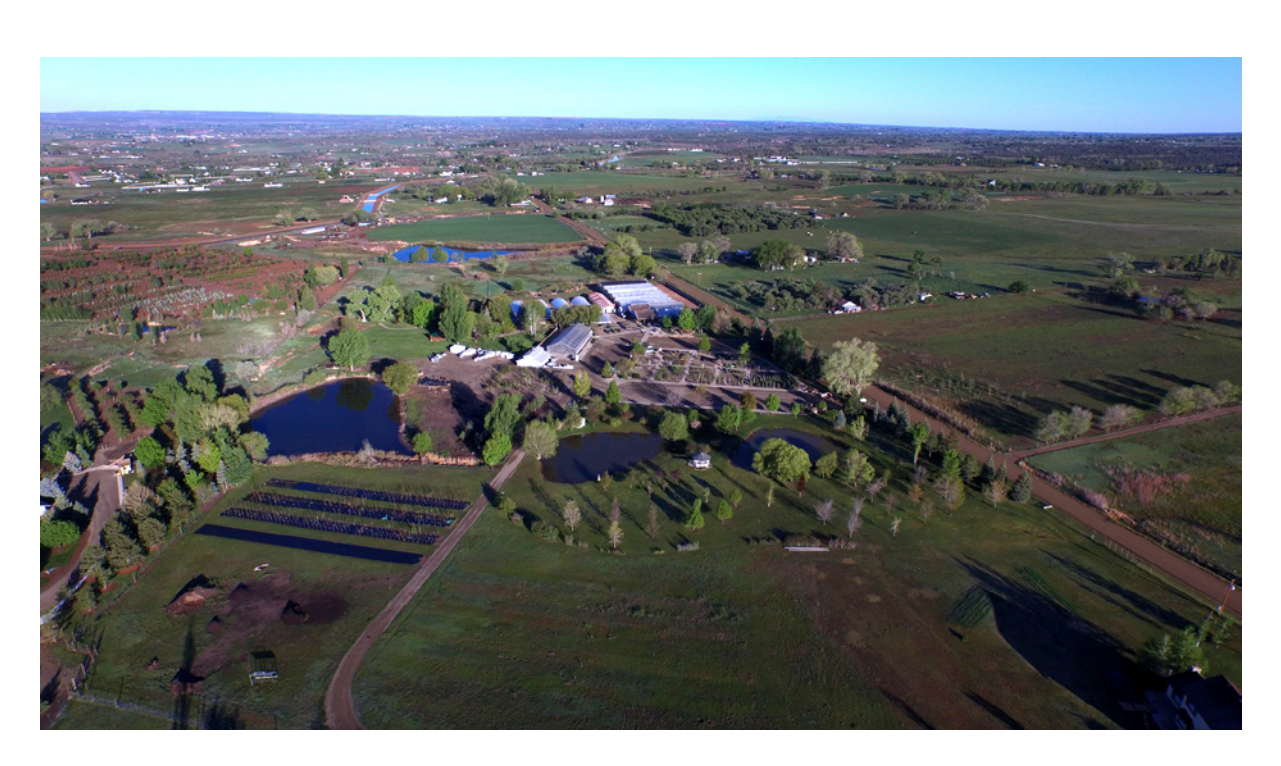
A wide vacant plot of land adjacent to the pot-in-a-pot growing area is a possible expansion field.