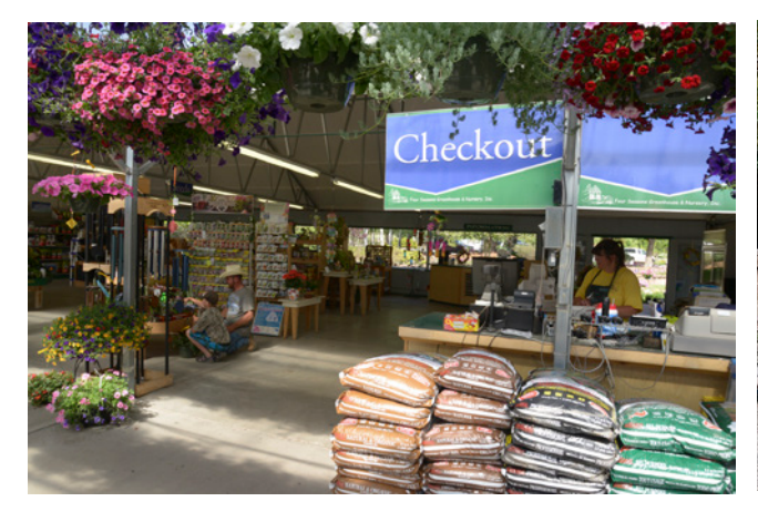
The Retail Center.