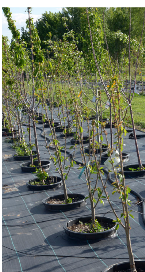
Pot-in-a-pot growing field adjacent to one of four ponds on the property. Located on the east side of the pond, with 1,500 - 1,600 pots.