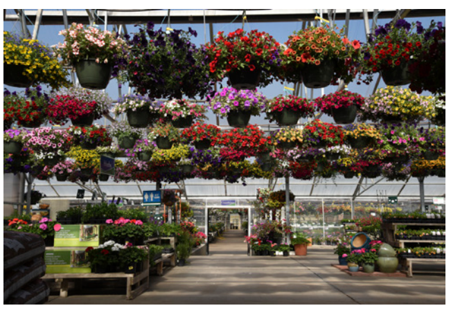
A Lexan glass greenhouse is a centerpiece of the Hanging baskets and bedding plants are some of the most popular inventory in the Retail Center.