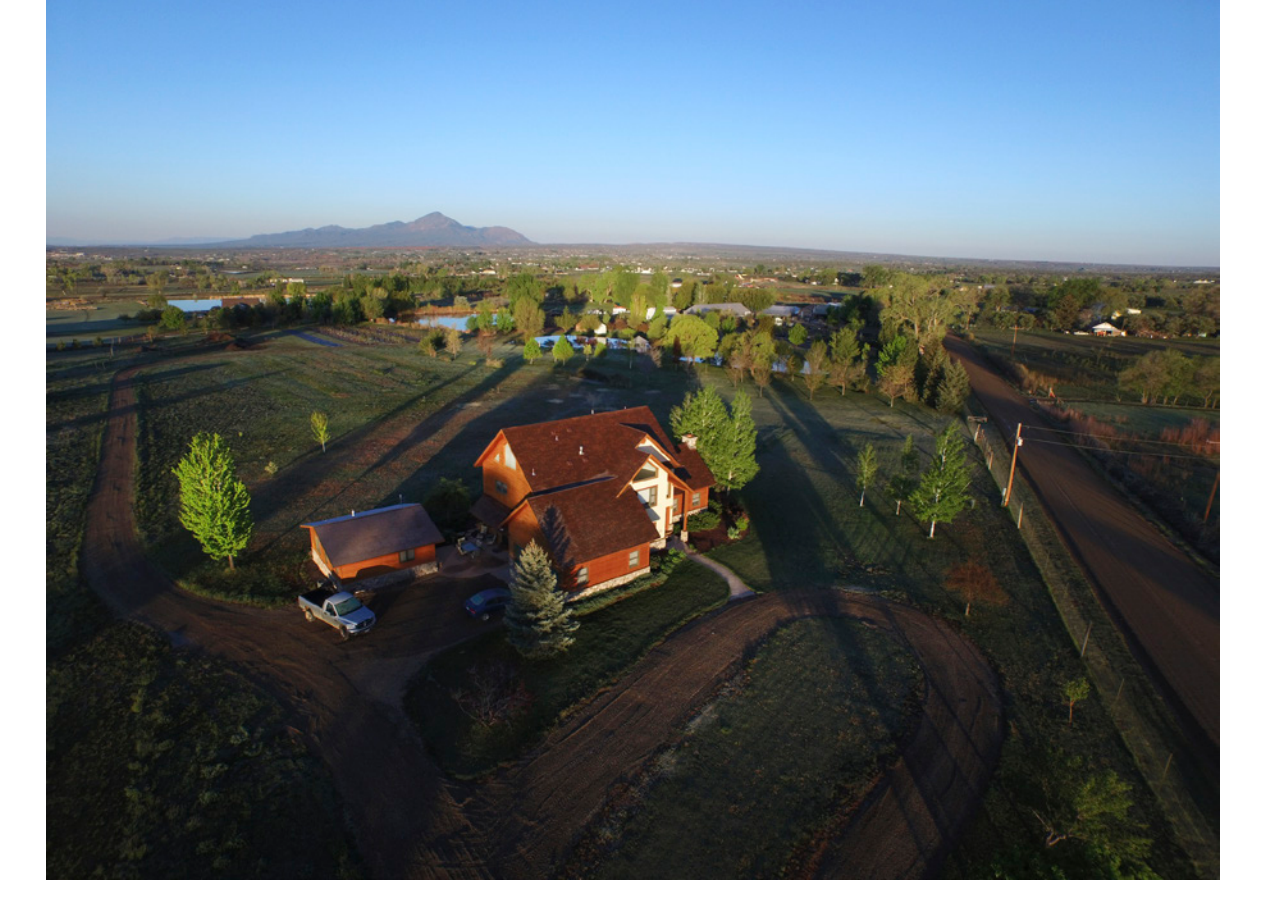
A private, 3-bedroom primary residence with one bedroom guest house is also on the property.