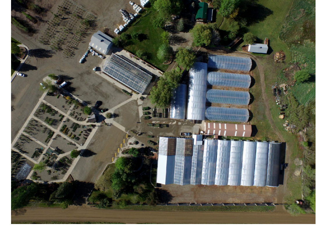
Greenhouses, nursery, retail operation and parking lot make up this assemblage of improvements.