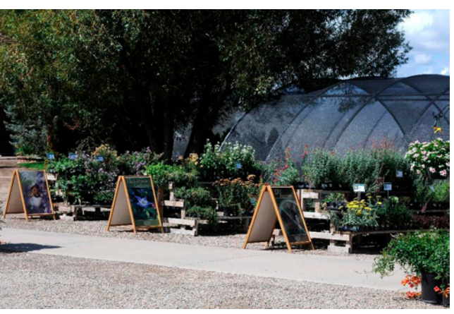
Outdoor merchandising of perennials has been a successful business component.