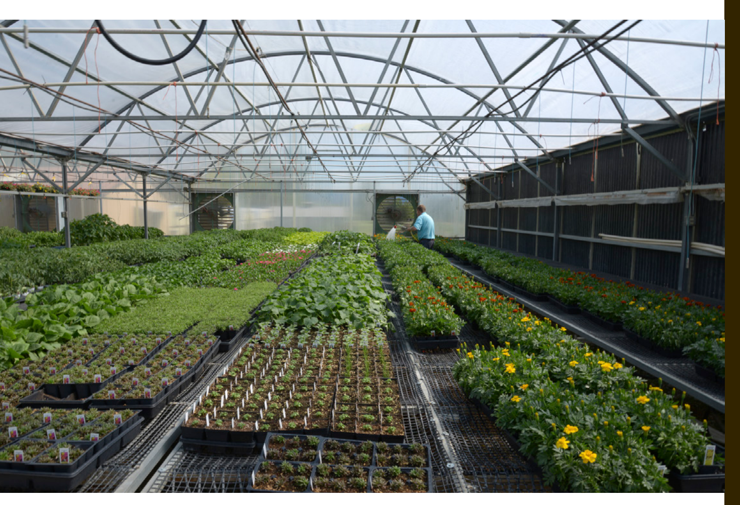
Winter and summer crops include tomatoes, chard, lettuces, arugula, and veggie starts.