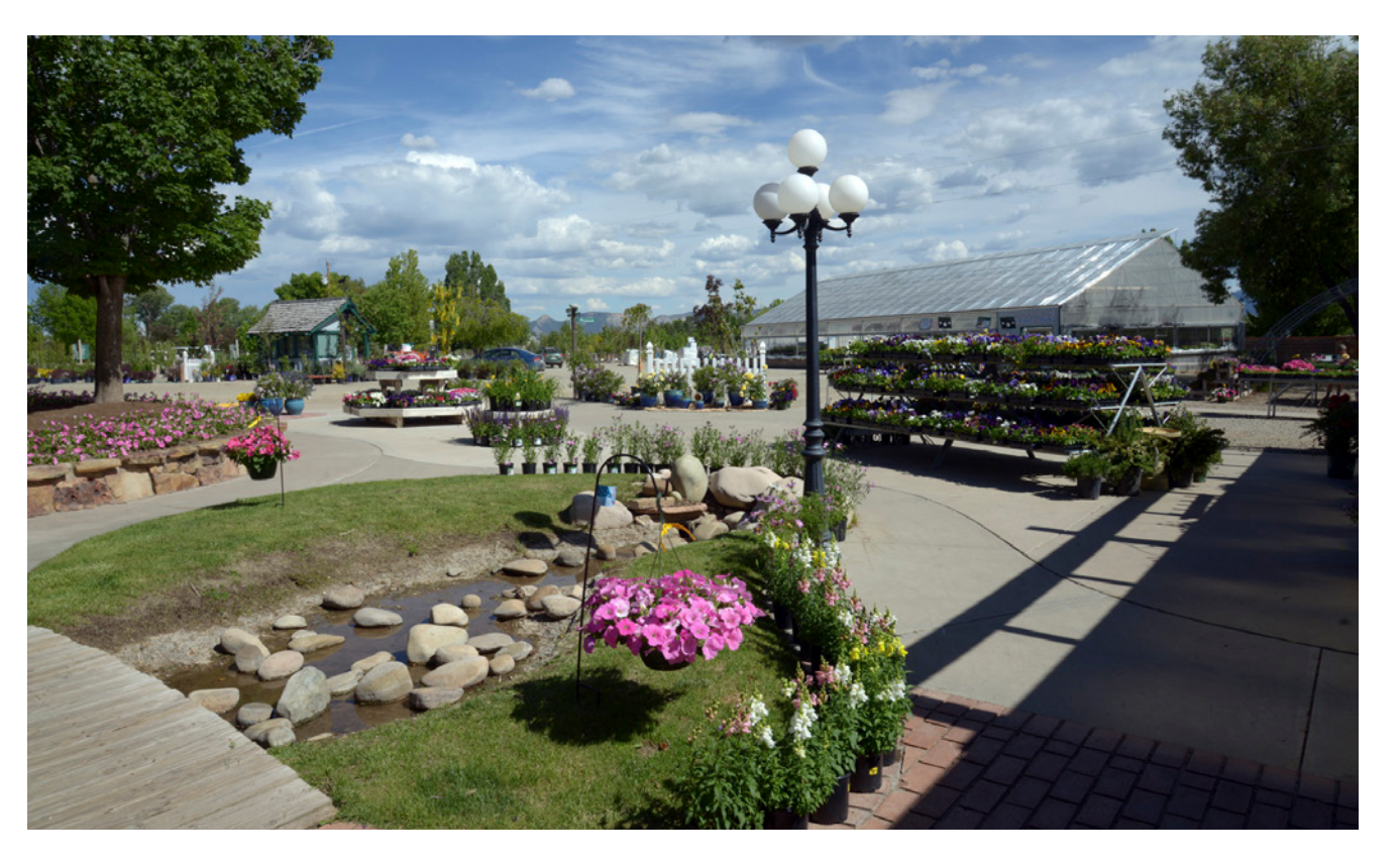
The retail nursery is an integral part of the business operation.