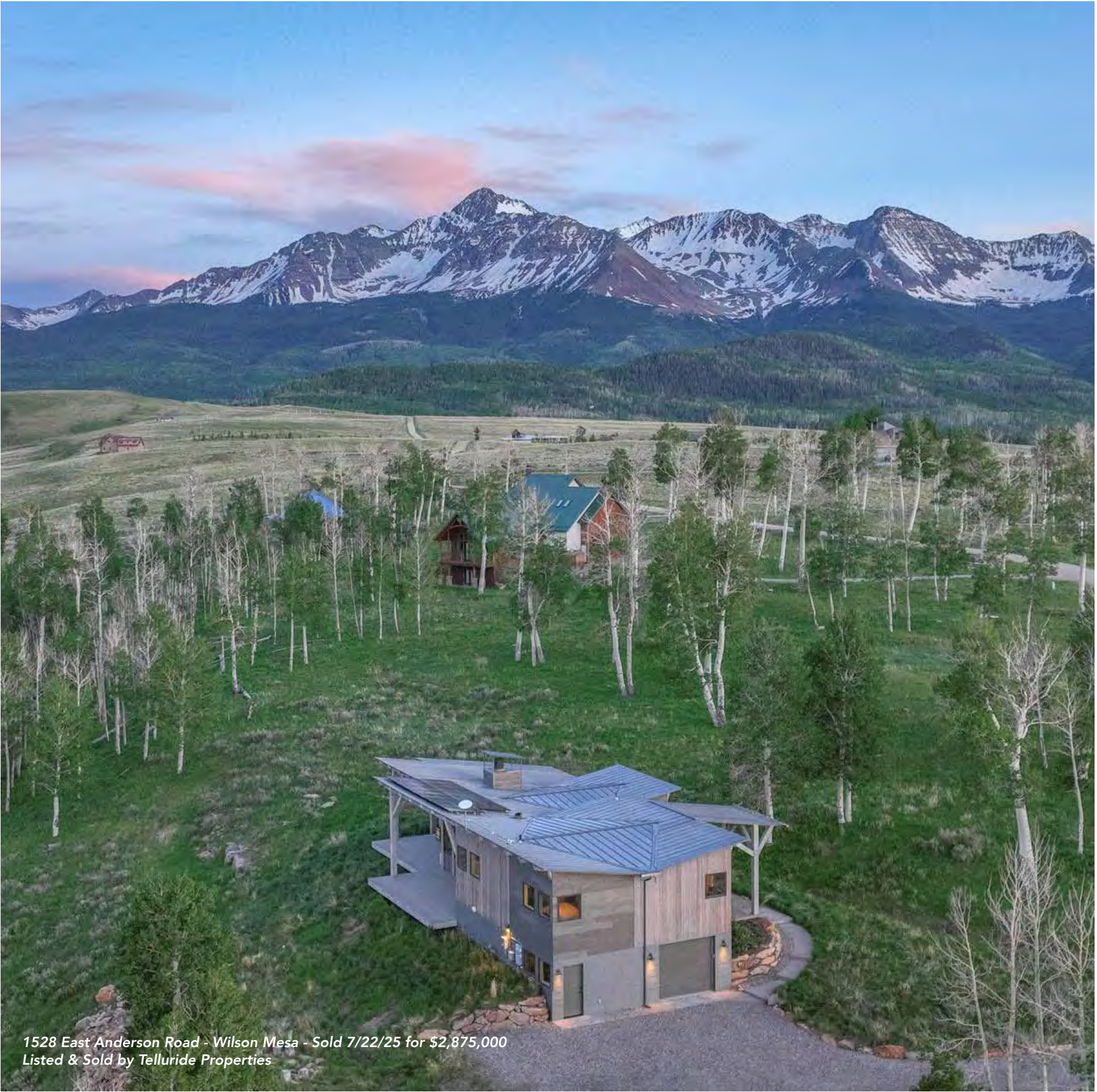
1528 East Anderson Road - Wilson Mesa - Sold 7/22/25 for $2,875,000 Listed & Sold by Telluride Properties

The information represented above is compiled from Telluride MLS data ytd as of 9/30/25 it excludes deed-restricted, commercial, & fractional properties. It includes homes and land.