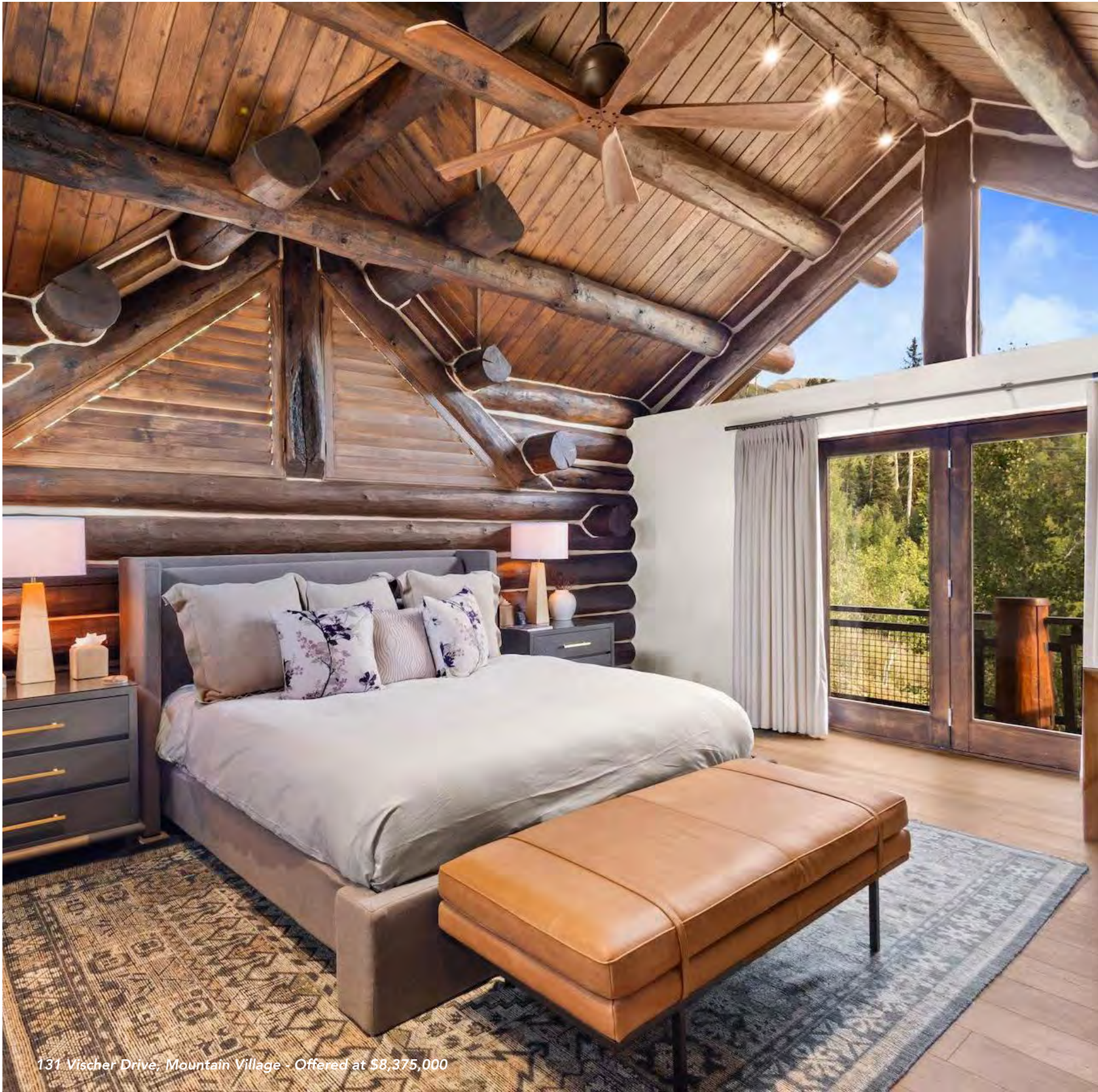
131 Vischer Drive, Mountain Village - Offered at $8,375,000