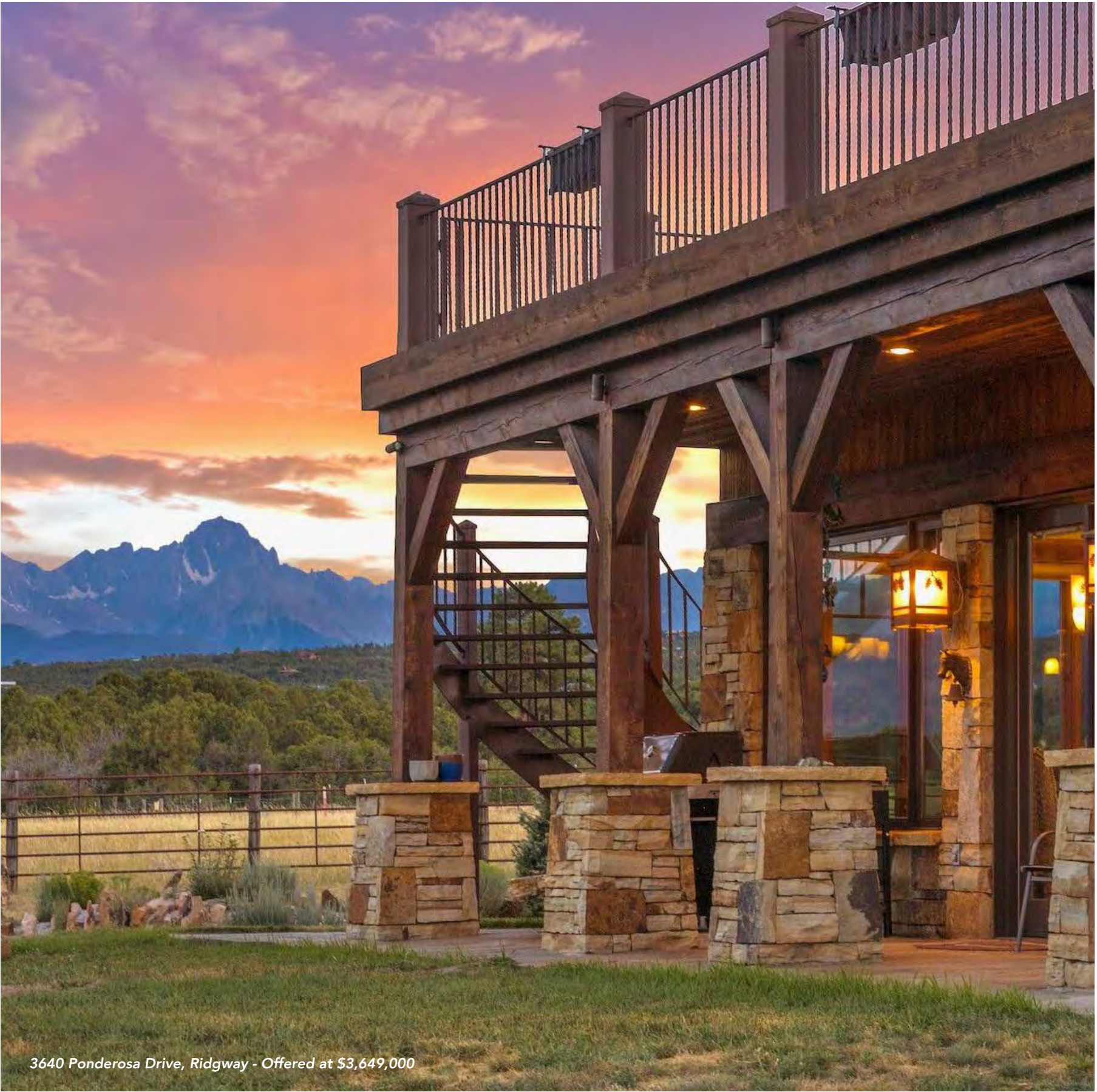
3640 Ponderosa Drive, Ridgway - Offered at $3,649,000