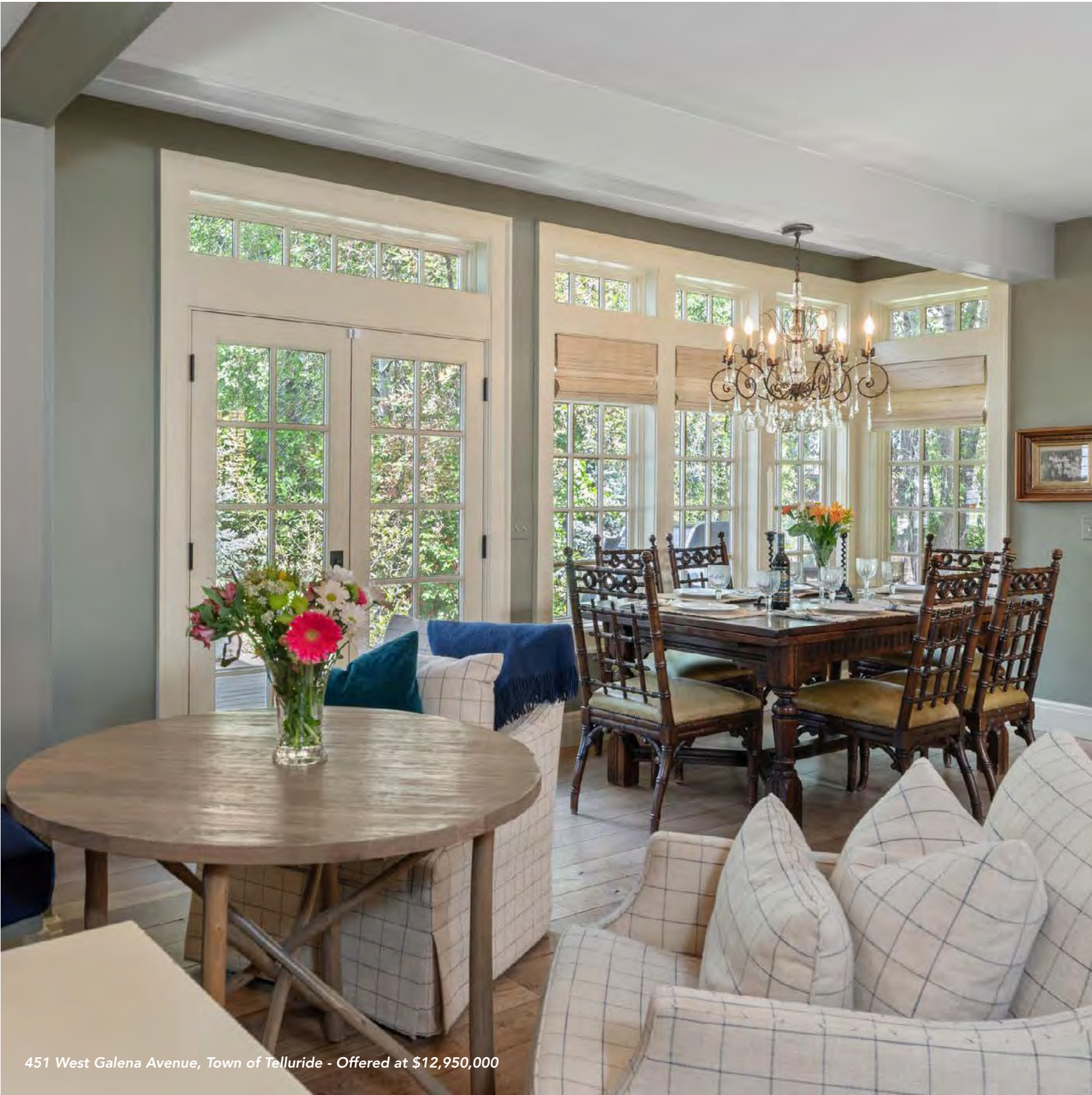
451 West Galena Avenue, Town of Telluride - Offered at $12,950,000

The information represented above is compiled from the Telluride MLS ytd as of 9/30/25 and includes the Idarado Subdivision & Valley Floor. It excludes deed-restricted, commercial, & fractional properties.